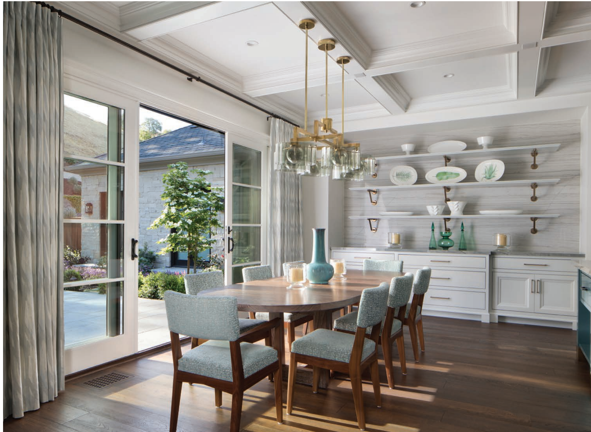
BELOW The celadon and blue laundry room shows the same attention to detail as the public rooms. Decorative artist Caroline Lizarraga consulted on the project's extensive paint schedule.