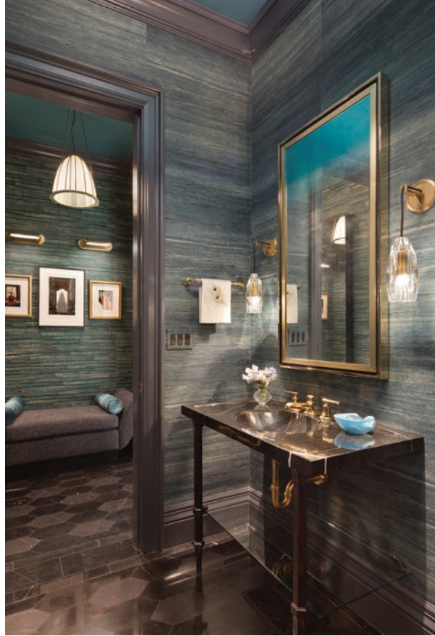
ABOVE The powder room vestibule is where the family exhibits their travel photos. Elmdon Picture Lights from Vaughn showcase them while Jonathan Browning Studios Chatelet Sconces bracket the vanity mirror.