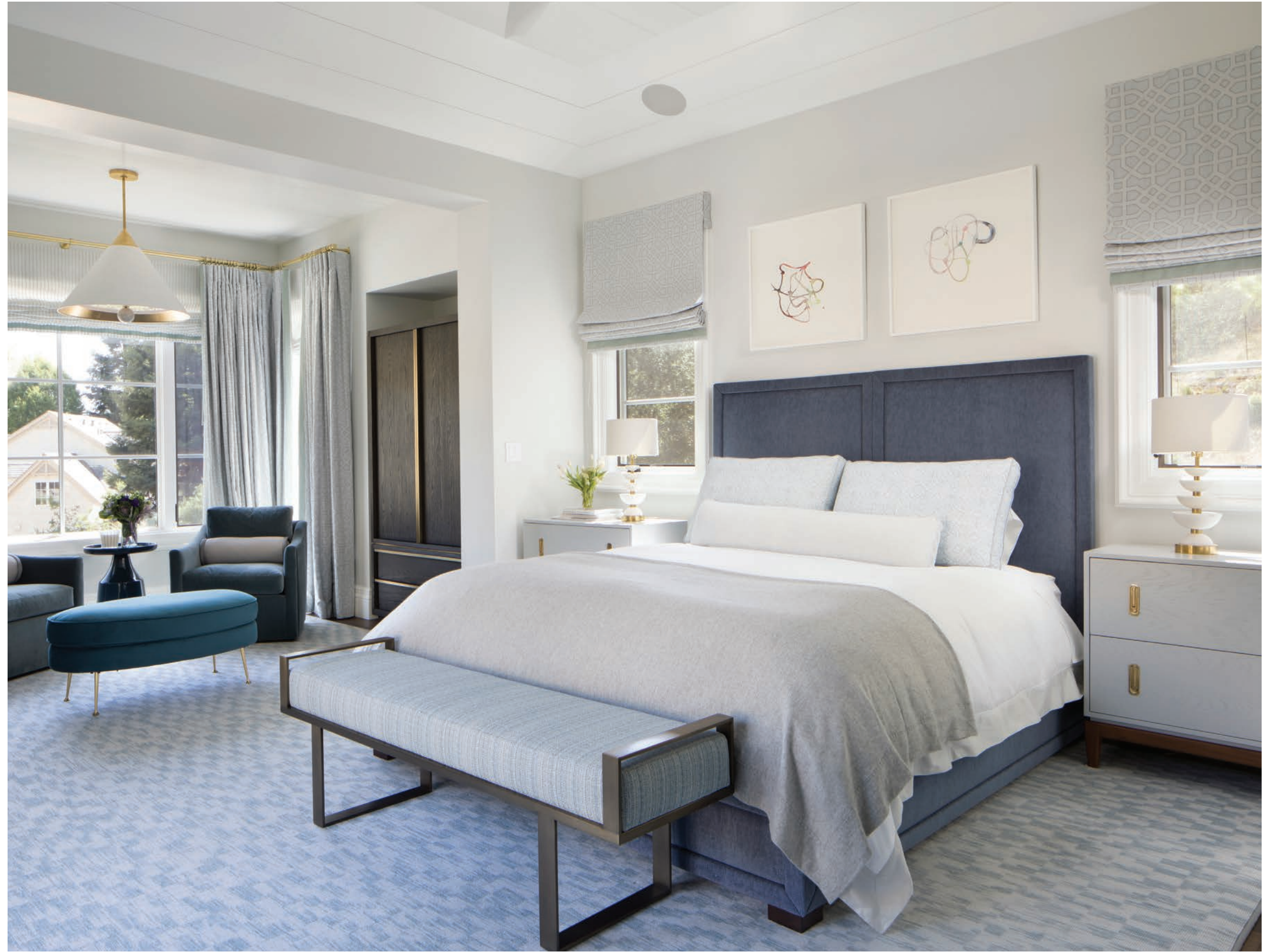
BELOW A pair of white Lawson Fenning's bedside cabinets flank the headboard upholstered in a blue Holly Hunt textile in the main guest room. Alabaster and brass table lamps from Vaughan illuminate each chest.