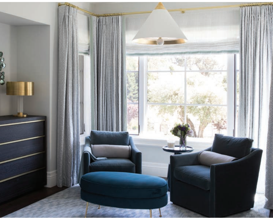
BELOW Tenaglia installed a pair of indigo velvet lounge chairs with a graceful sloping arm in the U-shaped bay window. Kelly Wearstler's Cleo Pendant from Visual Comfort adds both drama and architecture to the corner.